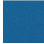
Blue Jay VOY05