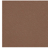
Olive Branch N12