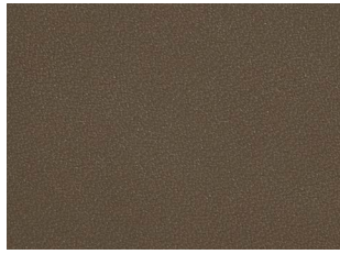
N12 Olive Branch