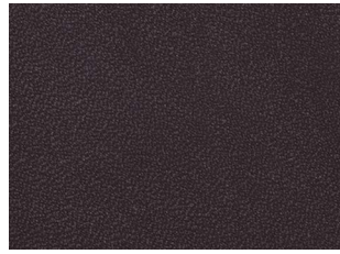
N17 Pitch Brown