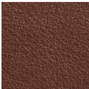
Good Earth ART05