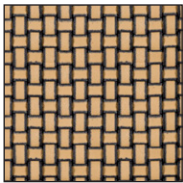
Classic Burnished ARW01